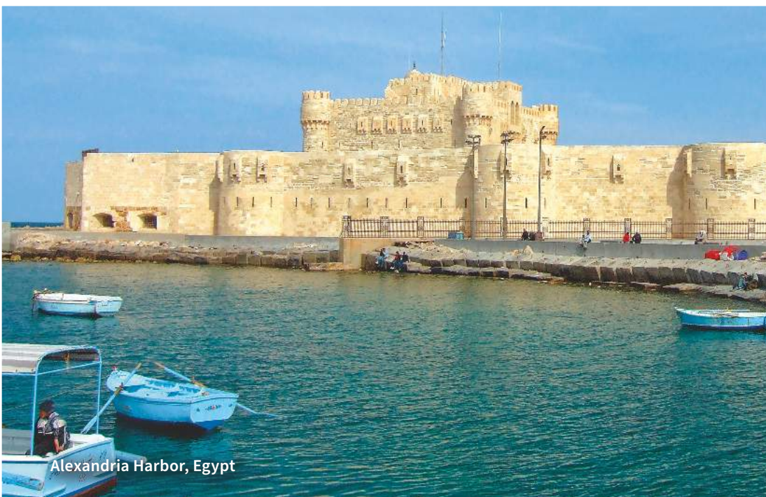
Alexandria Harbor, Egypt