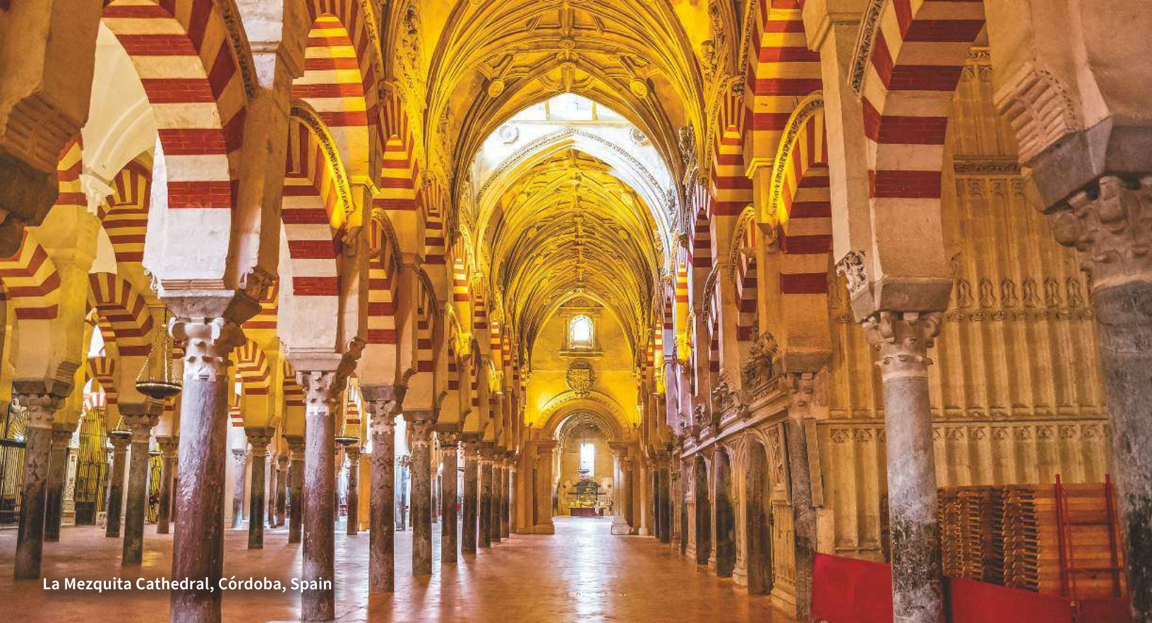
La Mezquita Cathedral, Córdoba, Spain