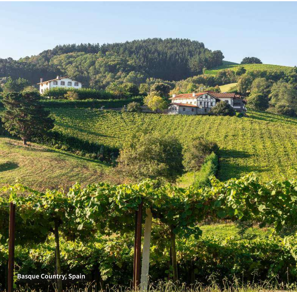
Basque Country, Spain