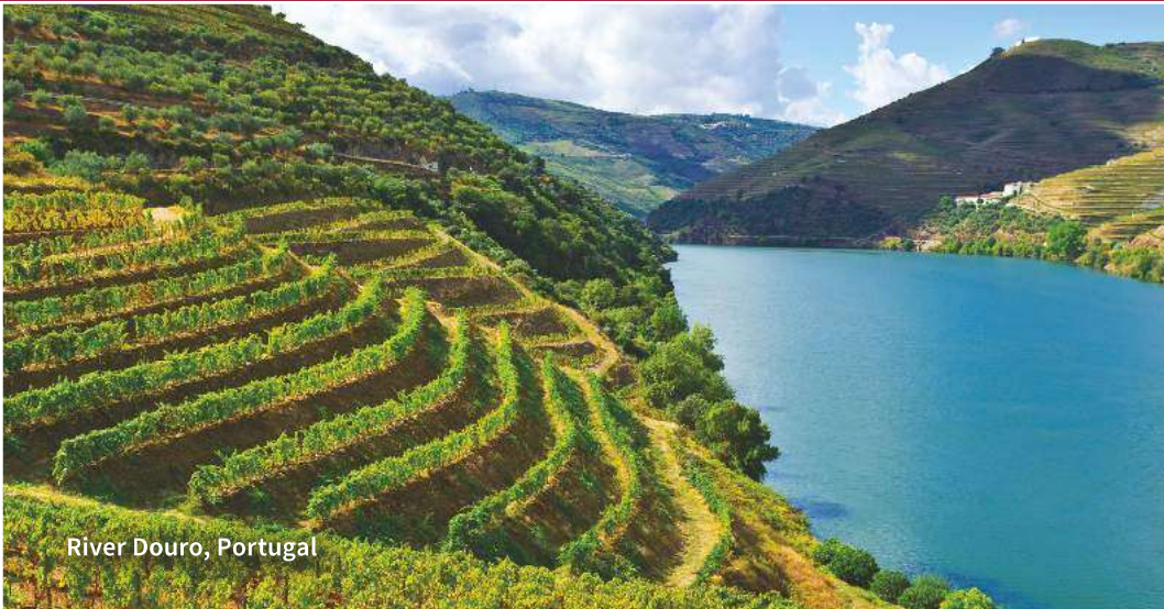
River Douro, Portugal