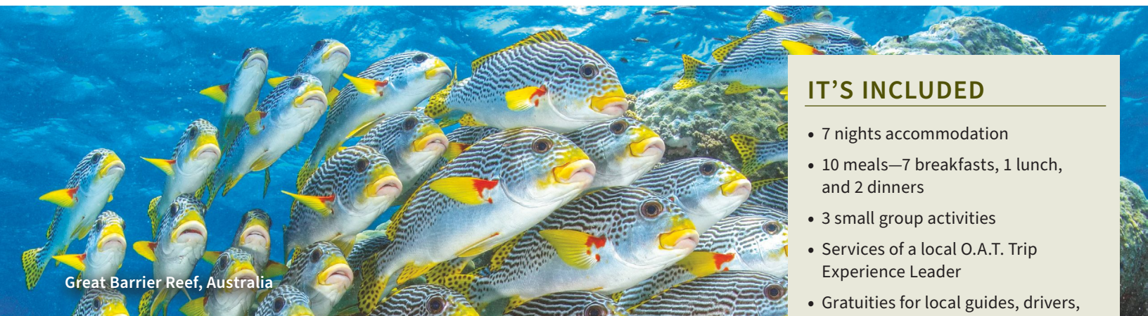
Great Barrier Reef, Australia

Transfer to the airport for your return flight home or to begin your New Zealand's Bay of Islands post-trip extension.