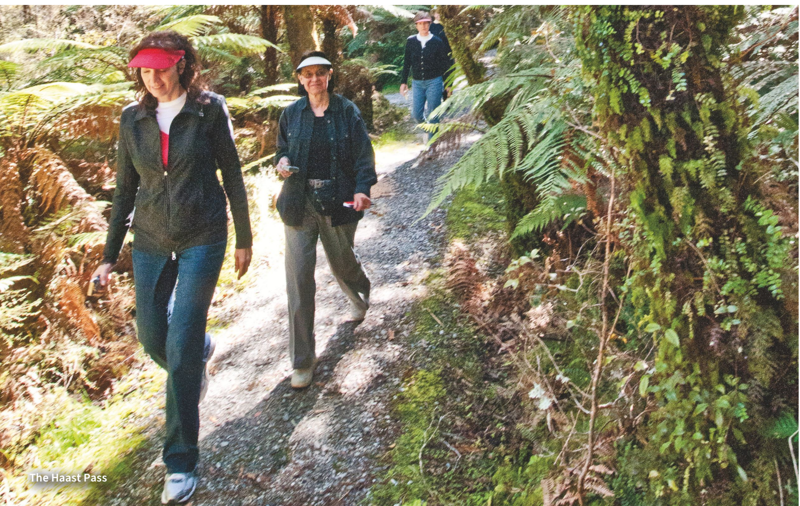
The Haast Pass