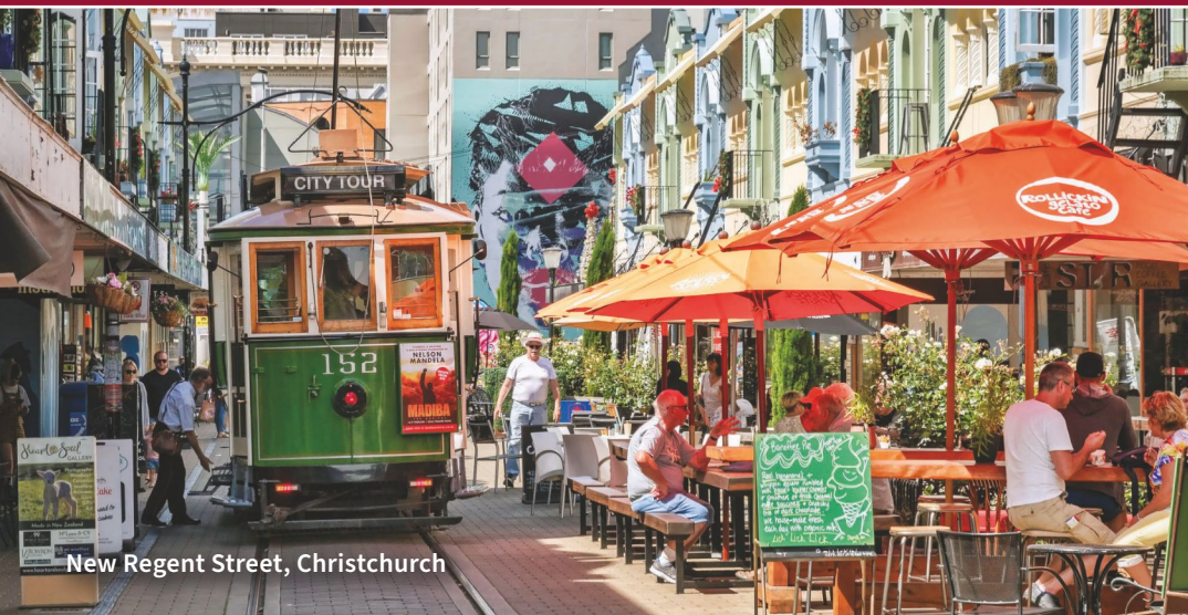
New Regent Street, Christchurch