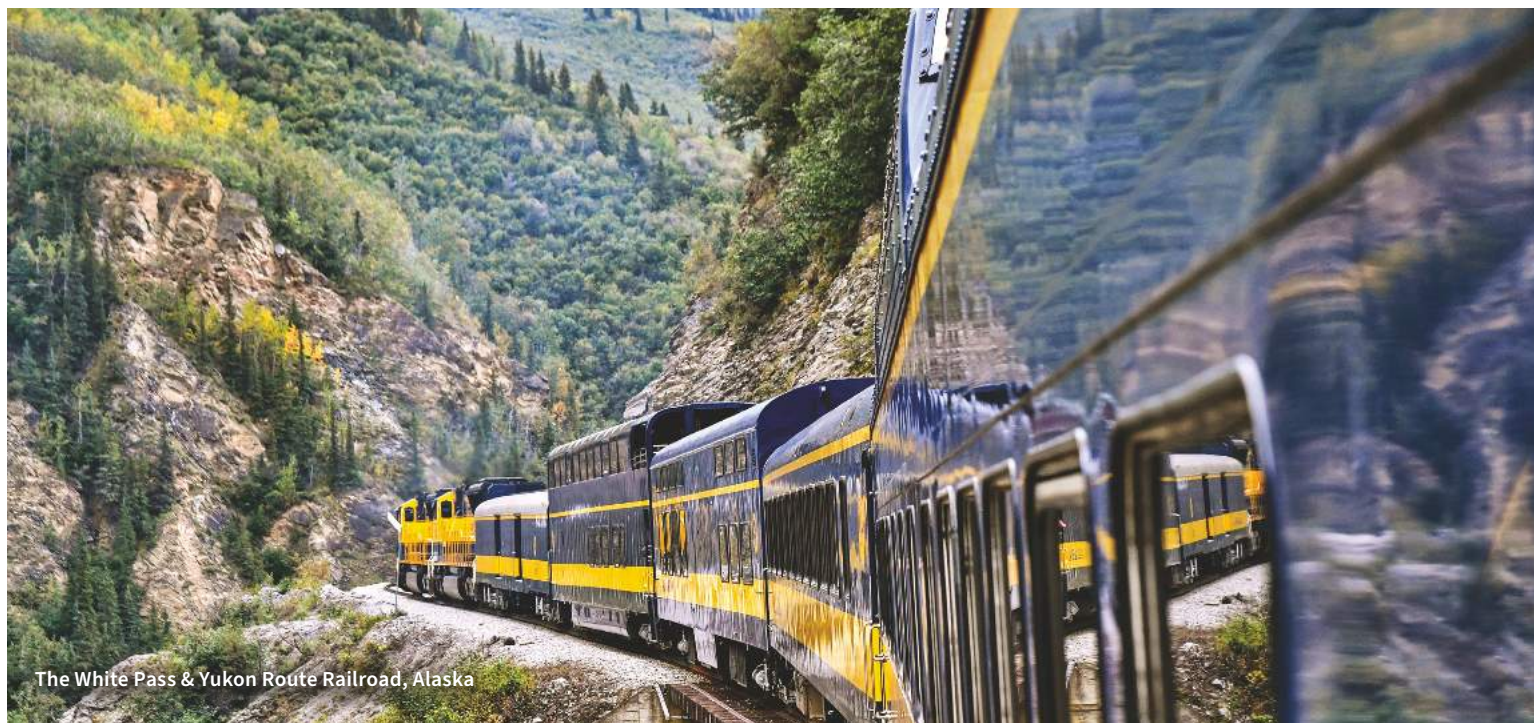
The White Pass & Yukon Route Railroad, Alaska