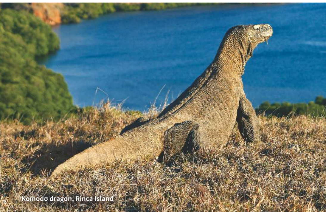
Komodo dragon, Rinca Island