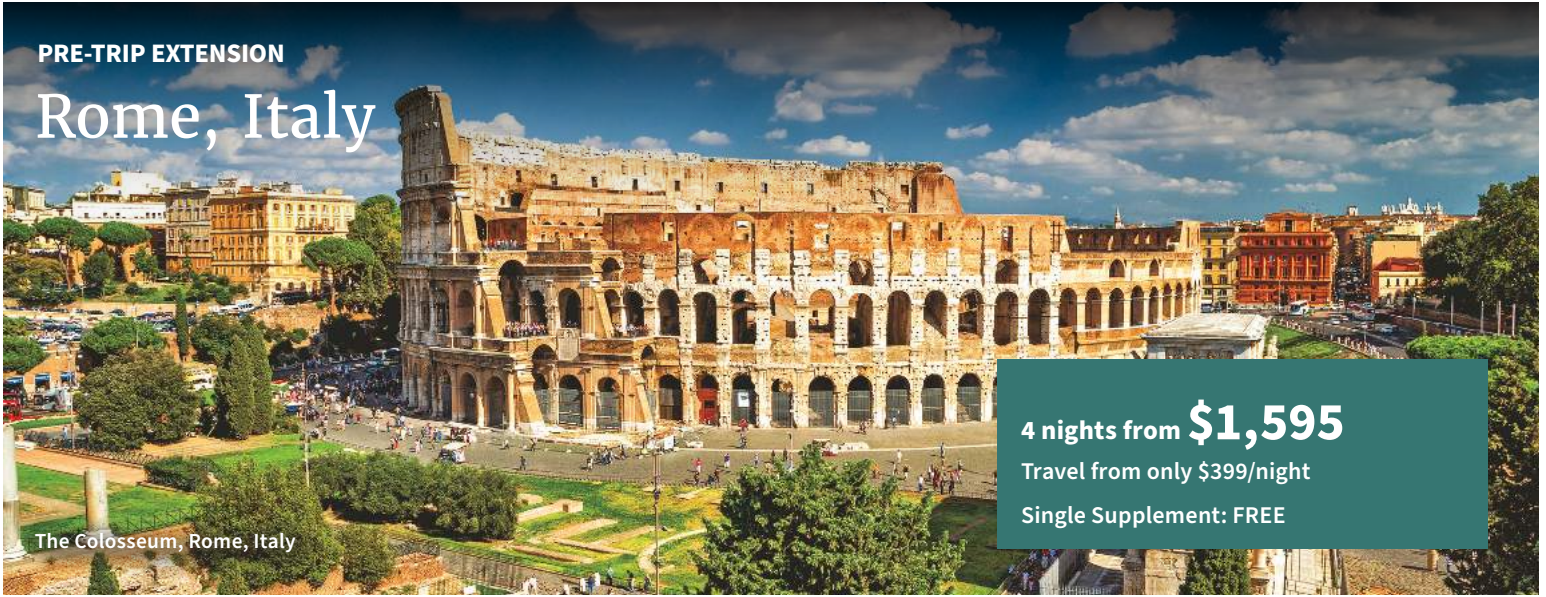
The Colosseum, Rome, Italy