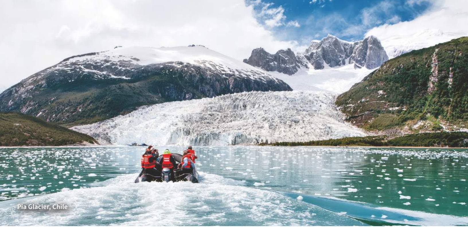
Pia Glacier, Chile