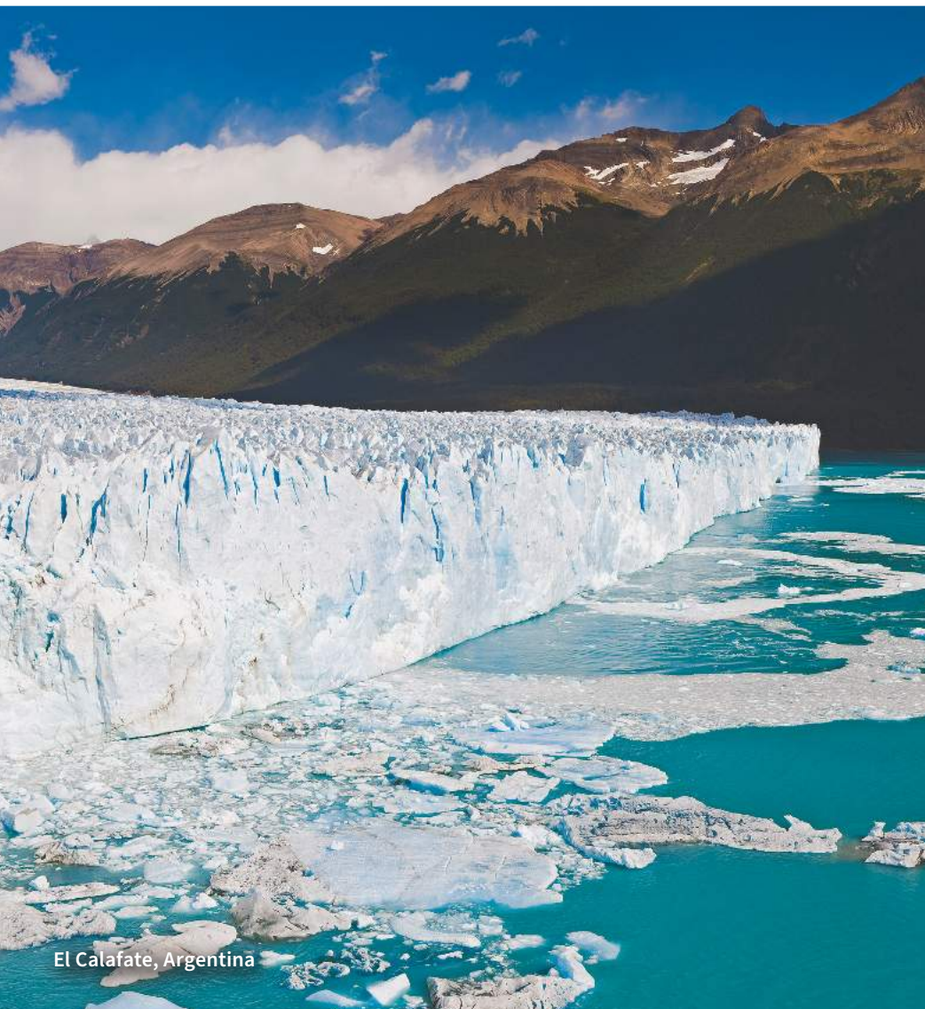
El Calafate, Argentina

Head overland to Chile and Torres del Paine National Park, centered around granite peaks that rise above the Patagonian steppe. After crossing the border into Chile, we'll arrive at the park in the afternoon to enjoy sightseeing and a wealth of photo opportunities.