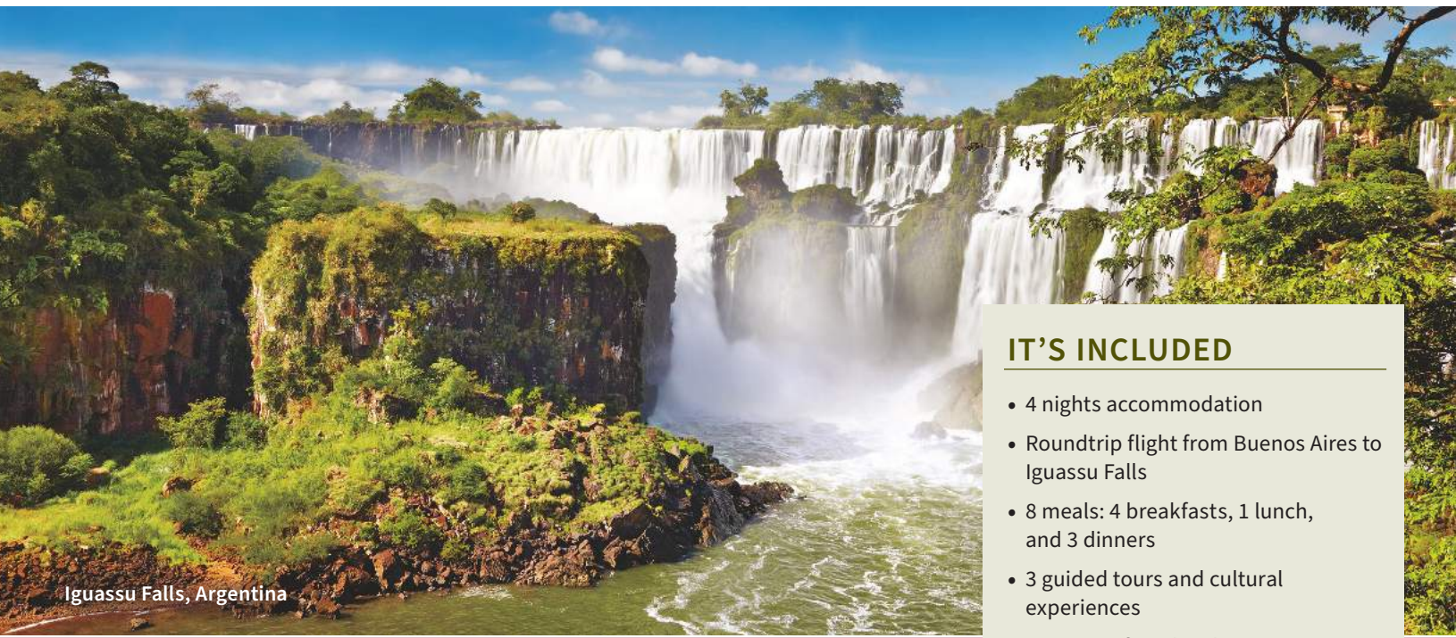
Iguassu Falls, Argentina