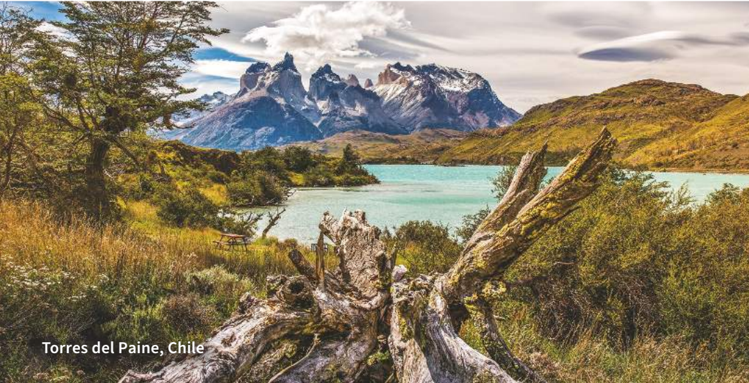
Torres del Paine, Chile