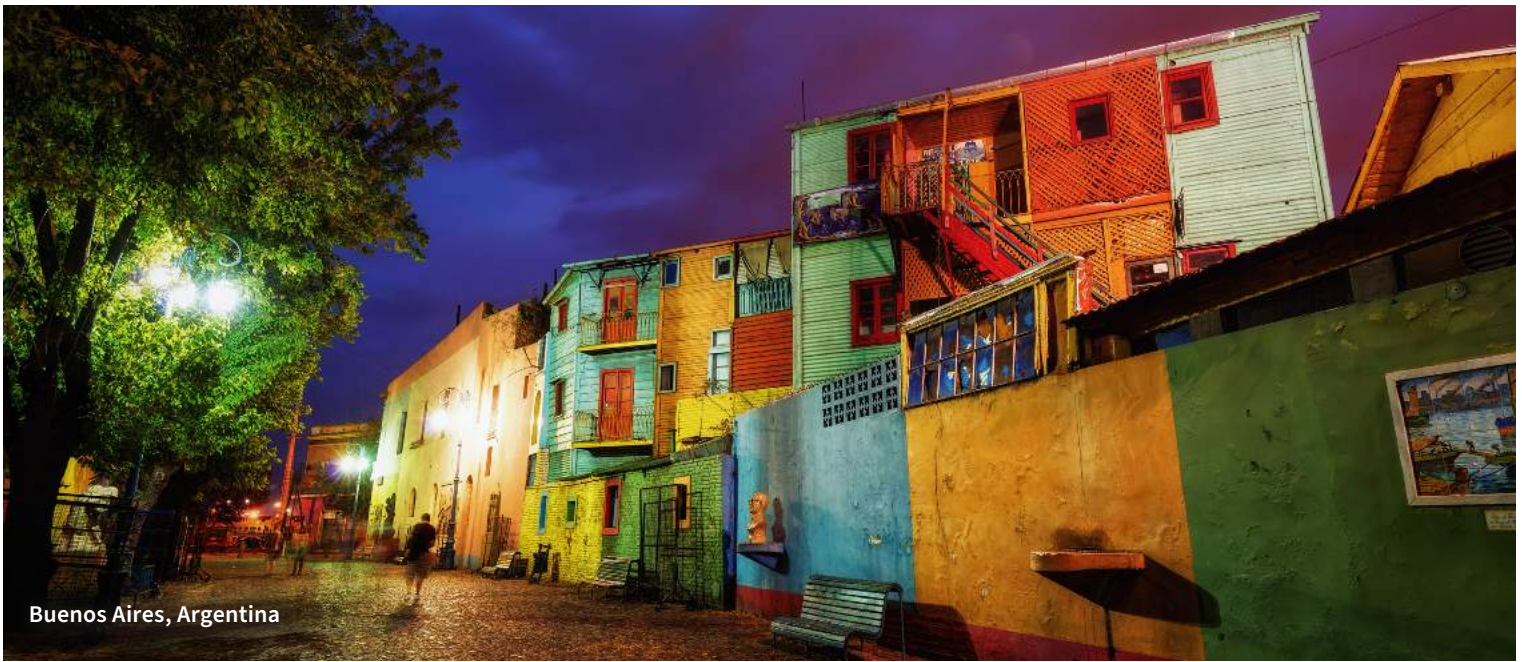
Buenos Aires, Argentina