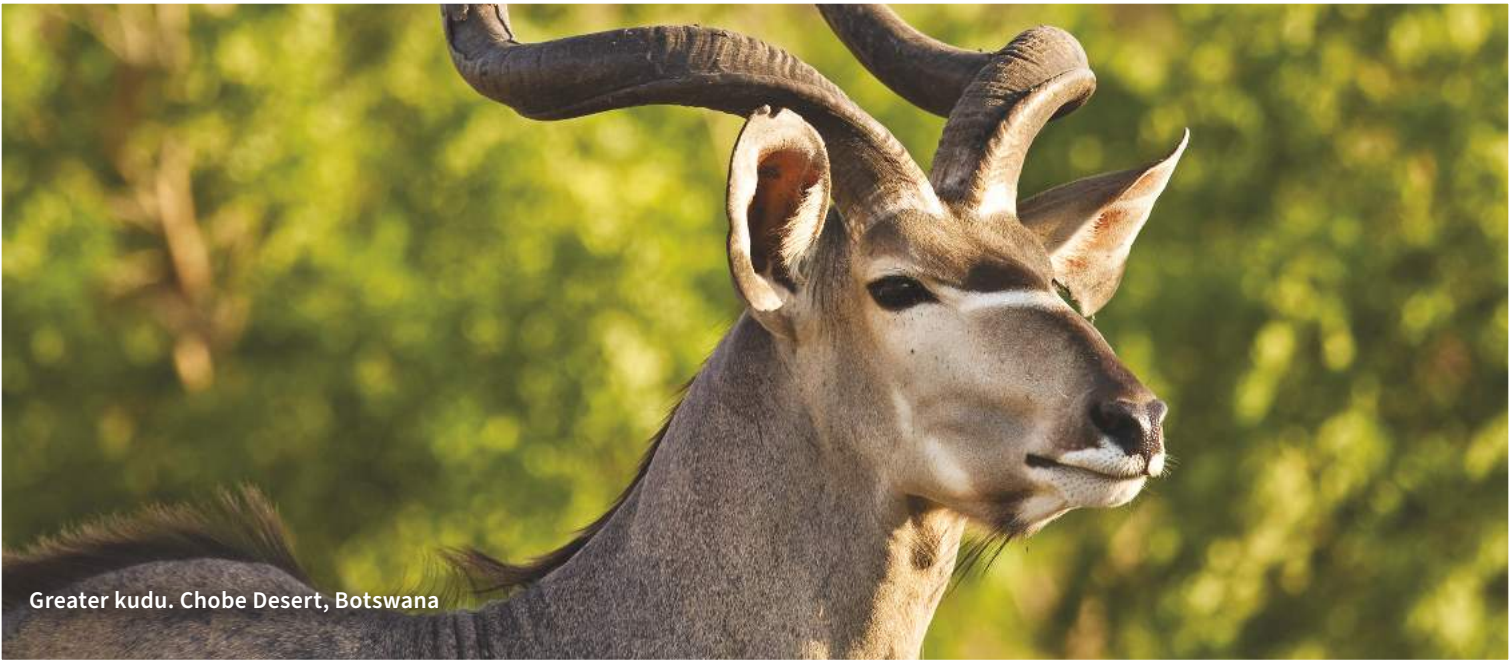
Greater kudu. Chobe Desert, Botswana