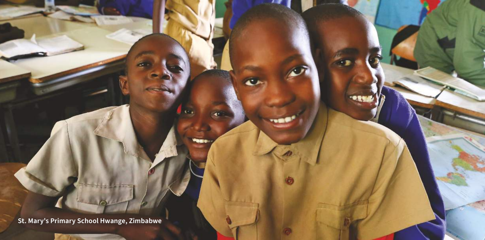
St. Mary's Primary School Hwange, Zimbabwe

Fly by light aircraft to Livingstone, and travel by road and boat to Chobe National Park. This evening, take a game-viewing drive before dinner.