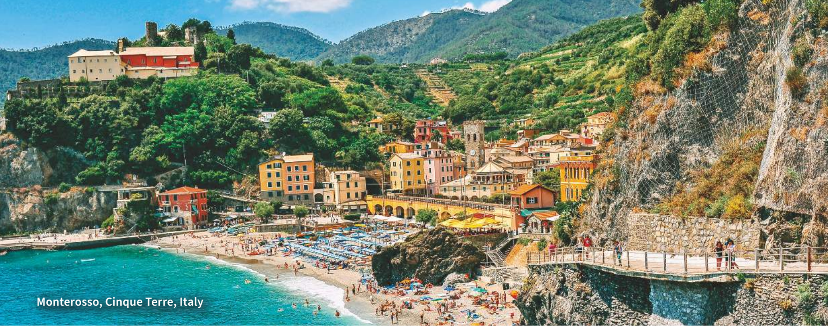
Monterosso, Cinque Terre, Italy