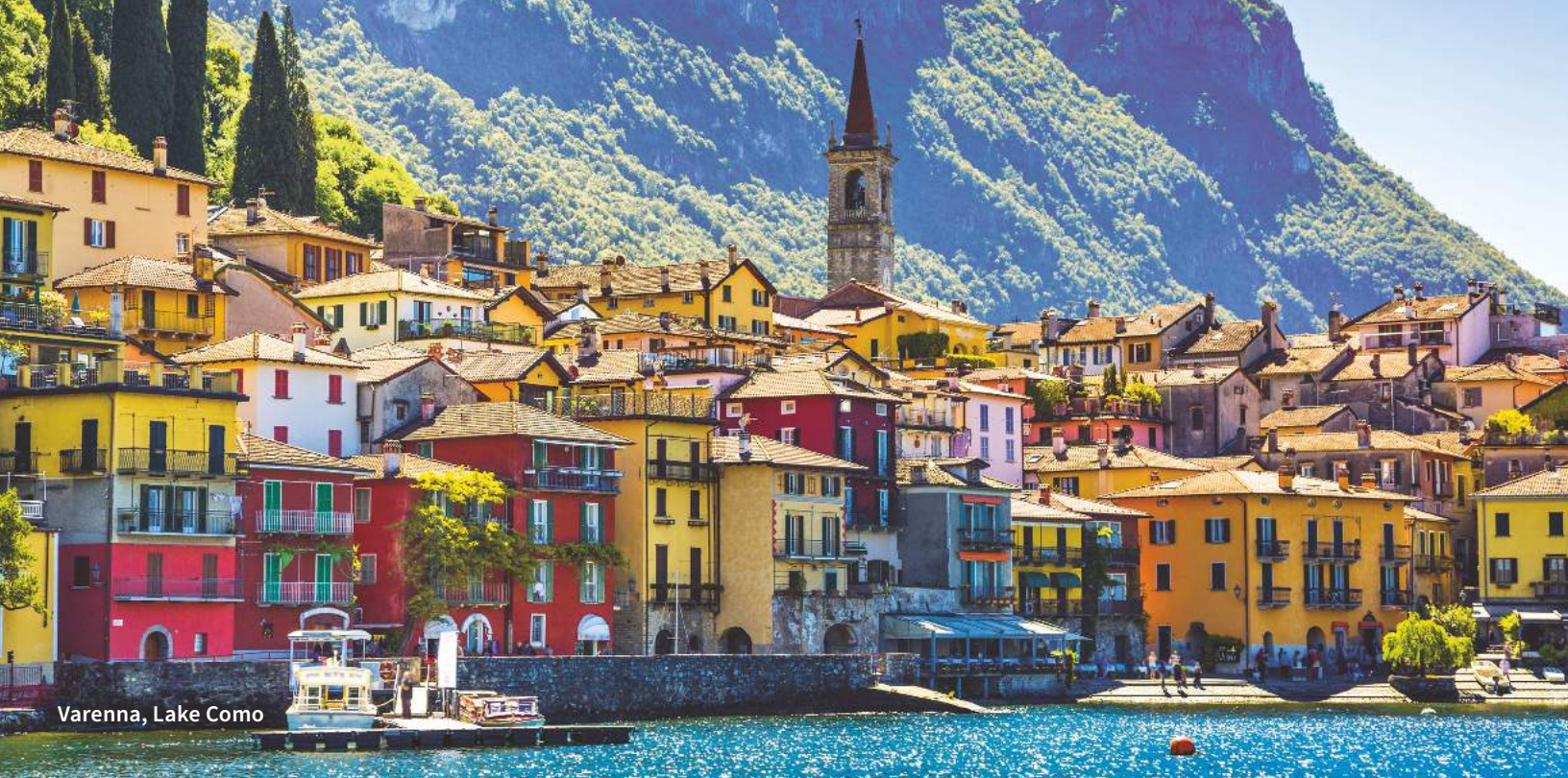
Varenna, Lake Como