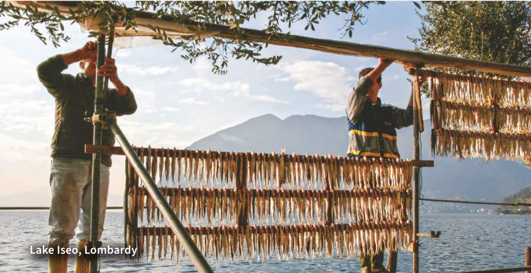
Lake Iseo, Lombardy